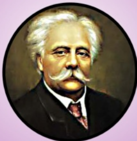
Gabriel Fauré 1847 - 1923

St. Lawrence Junior Choir and additional singers