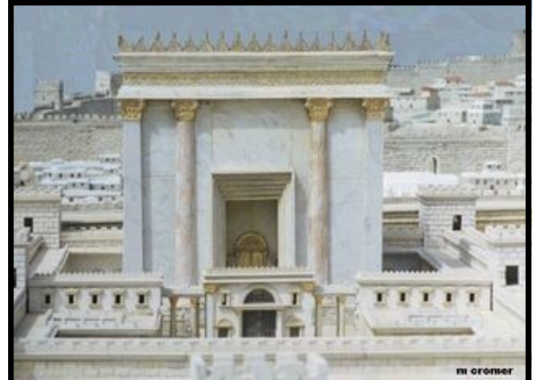
"Look, Teacher, what large stones and what large buildings!"